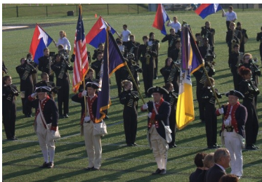
The Fairfax Resolves' Color Guard presents colors for the Opening Ritual.