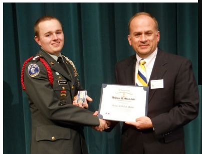
Pictures from JROTC presentations. From Top to Bottom: Chantilly High School, Herndon High School, South Lakes High School, Loudoun County High School