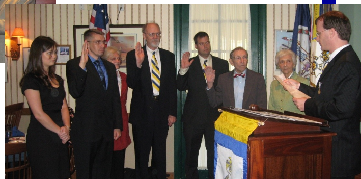
Compatriots participate in inductions at the September, October and November meetings